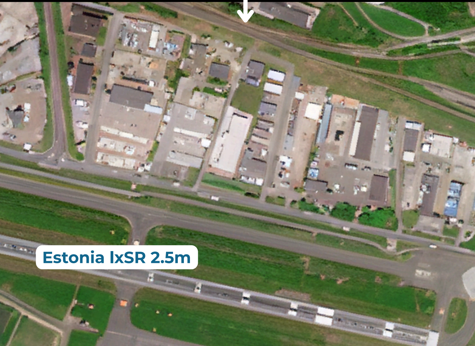
Estonia IxSR 2.5m