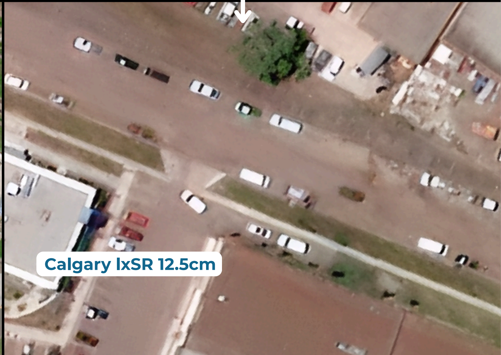
Calgary IxSR 12.5cm