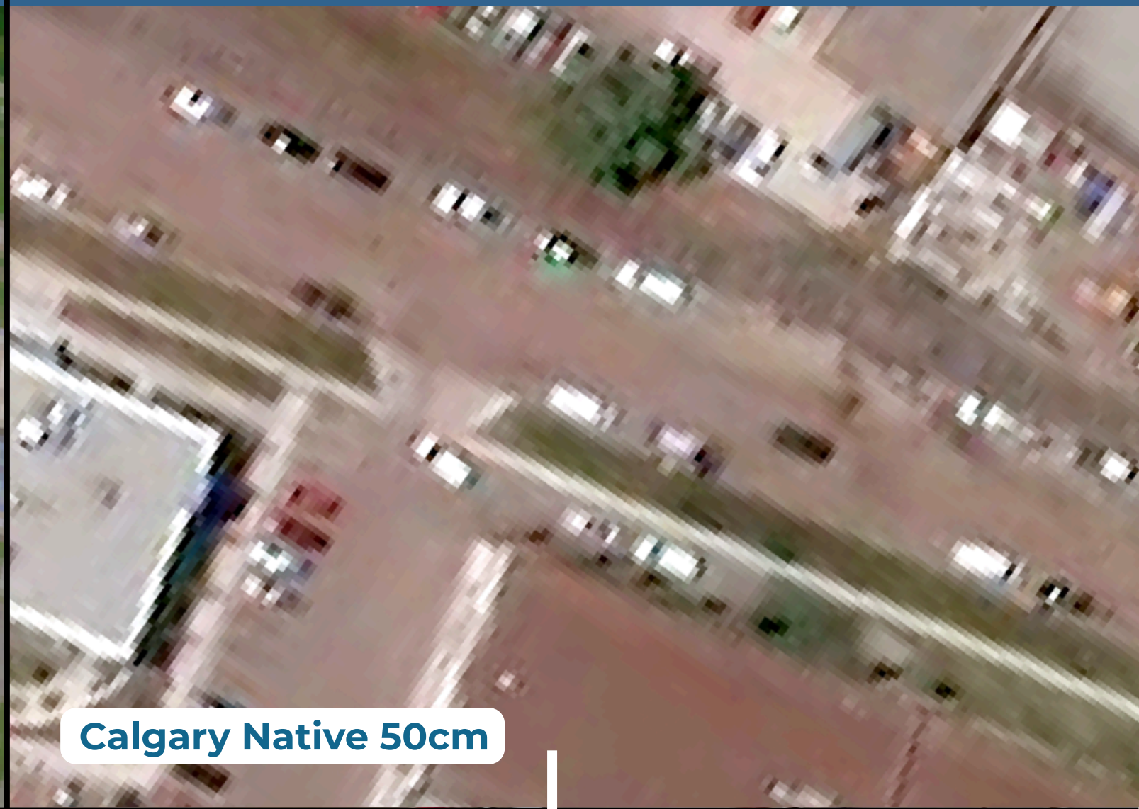
Calgary Native 50cm